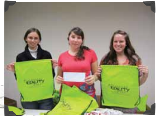
Pictured above are employees of Pike International donating five hundred dollars to support the Financial Reality Fair. They also assisted with stuffing the students reality fair kits.