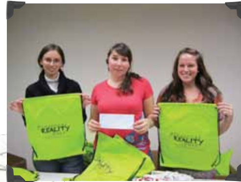
Pictured above are employees of Pike International donating five hundred dollars to support the Financial Reality Fair. They also assisted with stuffing the students reality fair kits.